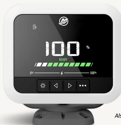
Pedestal-Style Console Display (shown)

Also Available in Flush-Mount Console Display