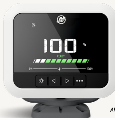
Pedestal-Style Console Display (shown)

Also Available in Flush-Mount Console Display