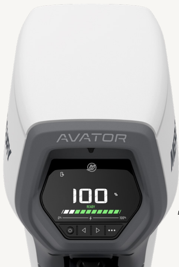
Integrated Outboard Display for Tiller Models

Monitor and control your Avator propulsion system from a vivid full-color display, optimized for readability in all light conditions. Your display shares speed, battery level, time and distance to “empty,” power output, and alerts. Everything you need to know to get the most from any journey.